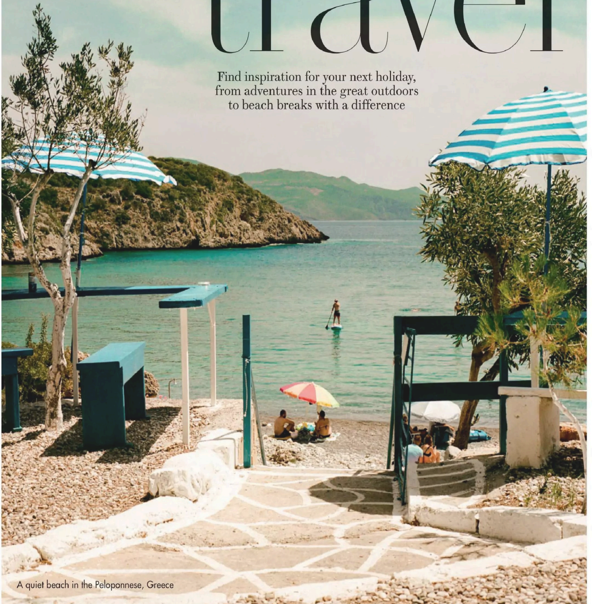
A quiet beach in the Peloponnese, Greece

Find inspiration for your next holiday, from adventures in the great outdoors to beach breaks with a difference