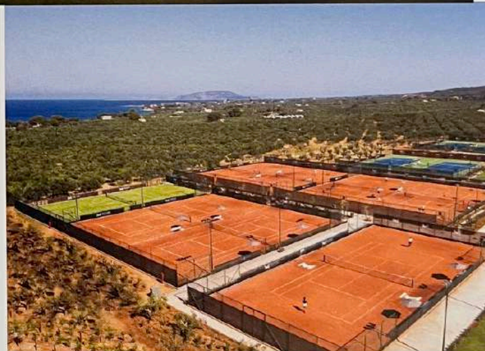
Mouratoglou tennis center